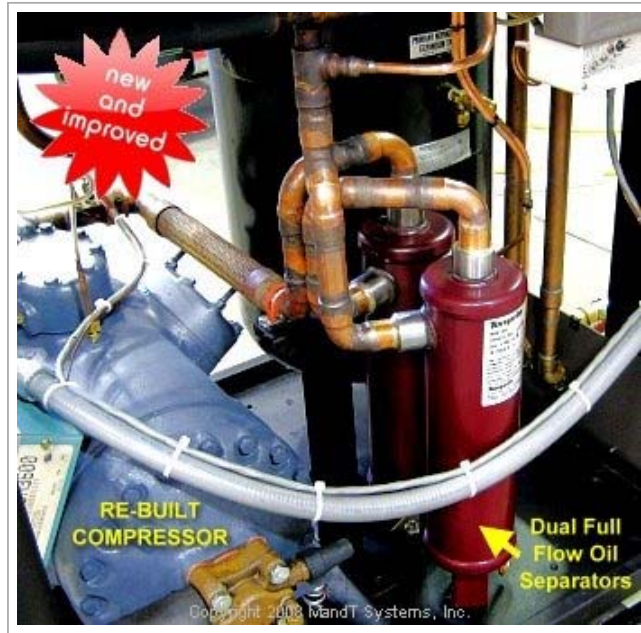
Improved Full-Flow Oil Separation (PFC-1100 shown)

Effective flushing is an important step in bringing the unit back to a "Like New" condition, and also for preventing contamination of the new parts that will be installed.