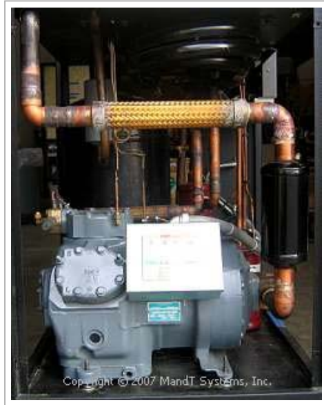
Retrofitted Suction Line Dryer (PFC-1100 shown)

If a compressor does burn out, the oil becomes extremely acidic. If all this acid is not removed when the compressor is replaced, the elevated acid levels will attack the new compressor and potentially cause another compressor motor burn-out. This is why other service companies have often times been unsuccessful in their attempts to restore such units to a reliable working state. Resulting in unsatisfied customers, additional down-time, and the customer having to buy a new replacement unit with the associated higher price tag.