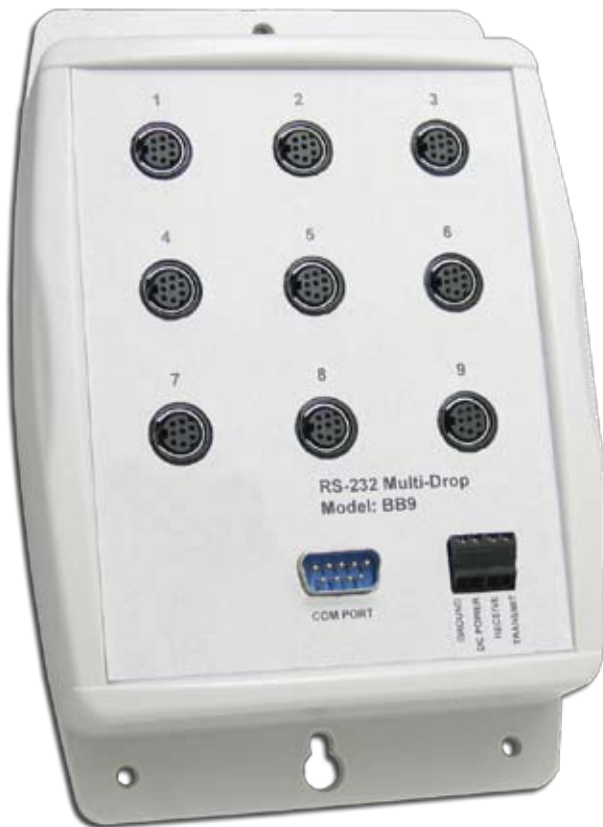
Standard 8 pin Mini-DIN Connector