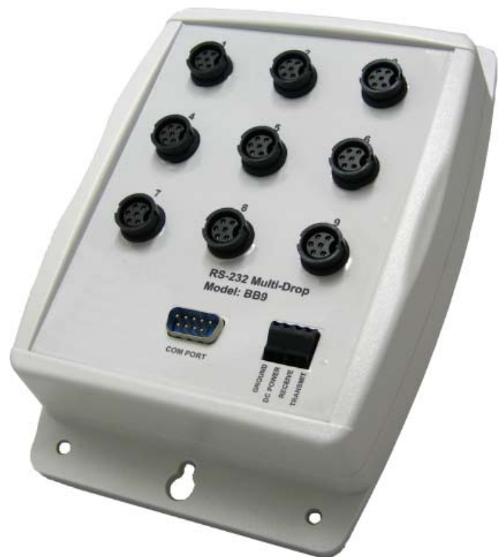
6 pin Locking Industrial Connector