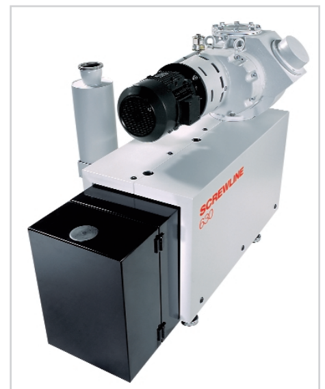
SCREWLINE SP 630 vacuum system with Roots pump (2000 m 3 /h)