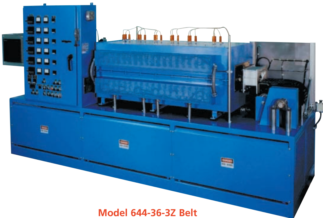
Model 644-36-3Z Belt

The continuous pusher furnaces typically include atmosphere doors, entrance section, heated section and a cooling section. Complete atmosphere controls and safety systems are incorporated. When automated, the pusher plates (carrier trays) form a train and are pushed through the furnace by an external stoker.