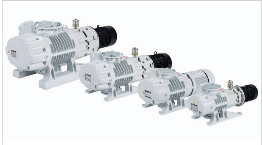
Range of RUVAC pumps: WAU 2001, WAU 1001, WSU 501, WAU 251

Each series consists of various sizes to always provide an optimized pumping speed for each application. All three series are available with or without integrated bypass valve (also known as pressure compensation valve).