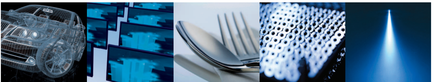
Electron beam melting