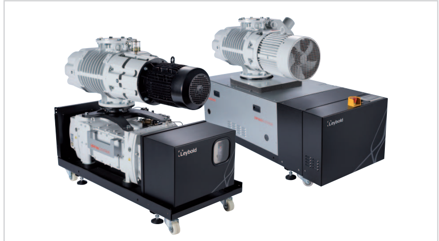
DRYVAC SYSTEMS: Modulare Standard-Vakuumsysteme für unterschiedlichste Anwendungen - kurzfristig lieferbar

ATEX Cat. 3 certified Roots pumps are available for the lines RUVAC WA/WAU 251/501/1001/2001.